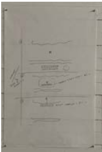
Peter Schjeldahl Diagram no.3 Facsimile (Marker on paper) 36 x 24 in.