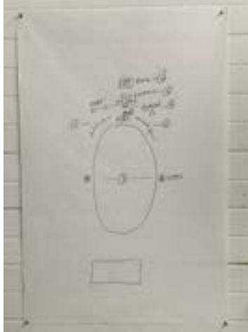
Peter Schjeldahl Diagram no.7 Facsimile (Marker on paper) 36 x 24 in

Documentary film material by Carmine Covelli