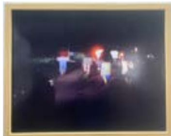
Night Digital print 17½ x 21 ½ in.