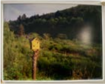
Birdhouse Digital print 13 x 17 ½ in.