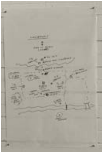
Peter Schjeldahl Diagram no.1 Facsimile (Marker on paper) 36 x 24 in.