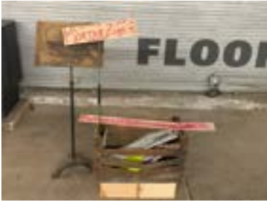
Mortar Zone Mixed media Dimensions variable