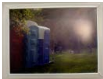
Portable Toilets Digital print 13x 17 ½ in.