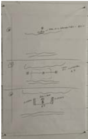
Peter Schjeldahl Diagram no.4 Facsimile (Marker on paper) 36 x 24 in