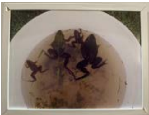
Frogs Digital print 13 x 17 ½ in.