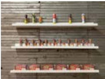
Fireworks Deadstock fireworks Dimensions variable (32 x 45 1/2 in.)