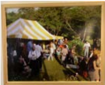
Gathering Digital print 17 ½ x 21 ½ in.