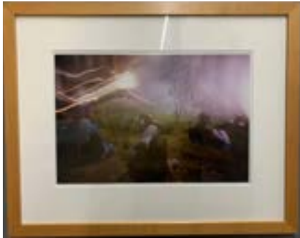
Streamers Digital print 18 x 23 in.