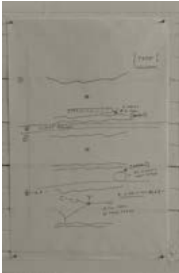
Peter Schjeldahl Diagram no.2 Facsimile (Marker on paper) 36 x 24 in.