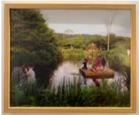
Pond Digital print 17 ½ x 21 ½ in.