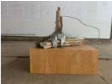
Firework Stump Mixed media Dimensions variable (appx. 41 x 36 in.)