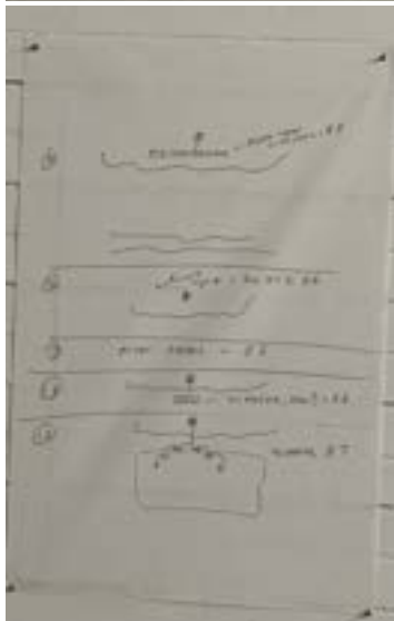
Peter Schjeldahl Diagram no.5 Facsimile (Marker on paper) 36 x 24 in