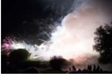
Rob Howard Fireworks, 2015 Digital print 27 x 37 in.