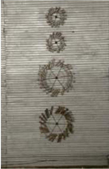
Roman Mandalas Metal, used roman candles Dimensions variable