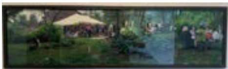
Fourth of July Panorama Digital print 14 x 49 in.