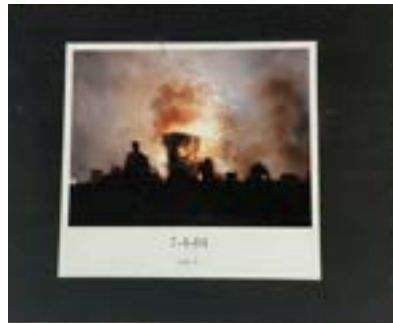
Stephen Shore 7-4-04, vol. 1 , 2004 photobook edition 1/20