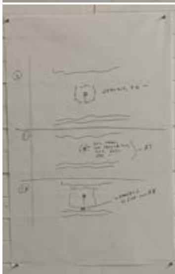
Peter Schjeldahl Diagram no.6 Facsimile (Marker on paper) 36 x 24 in