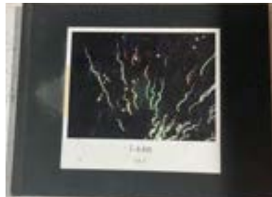
Stephen Shore 7-4-04, vol. 2 , 2004 photobook edition 1/20