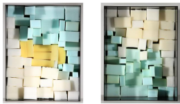
All of Us 16 x 20 diptych Archival pigment print ed. 3 + 2 AP