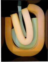
U & I 8 x 24" Archival pigment print ed. 3 + 2 AP