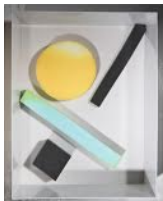
OI 18 x 24" Archival pigment print ed. 3 + 2 AP