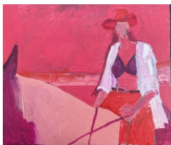
Jessie Lee Nash Self as a horse (After Tracey) , 2023 Oil on canvas 21 x 25 in 53.34 x 63.50 cm