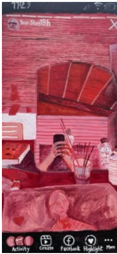
Jessie Lee Nash Self as the internet , 2023 Oil on canvas 57 x 27.50 in 144.78 x 69.85 cm