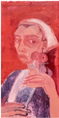
Jessie Lee Nash Bouquet (Self as PMB) , 2023 Oil on canvas 27 x 14 in 68.58 x 35.56 cm