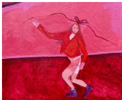
Jessie Lee Nash I also never became a dancer , 2023 Oil on canvas 22 x 27 in 55.88 x 68.58 cm