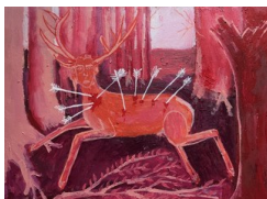
Jessie Lee Nash Self as a wounded deer, 2023 Oil on canvas 11 x 15 in 27.94 x 38.10 cm