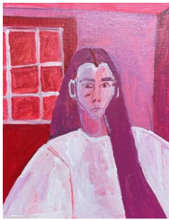
Jessie Lee Nash Self as Stamford (2) , 2023 Acrylic on canvas board 10 x 8 in 25.40 x 20.32 cm