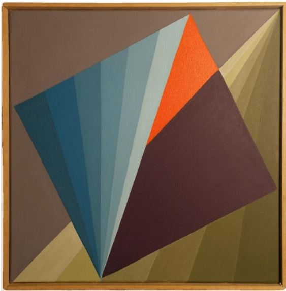
Anton Stankowski: Bewegtes Quadrat , 1993